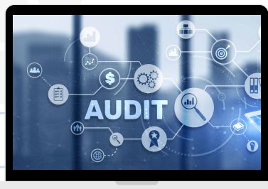
Independent Verification and Validation (IV&V)

Bovian combines technical expertise, a team spirit, and excellent customer service to be your "go to" firm for RMF and cybersecurity with expertise in: